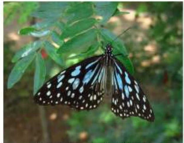
Dark Blue Tiger Butterfly Felix Sekar SYBSc A