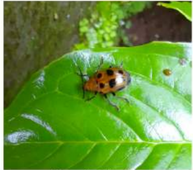
Bean Leaf Beetle Siddhesh Kolambkar, SYBSc B