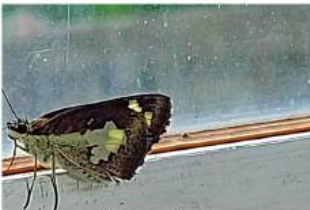
Udaspes Folus Komalpreet Kaur, SYBSc A