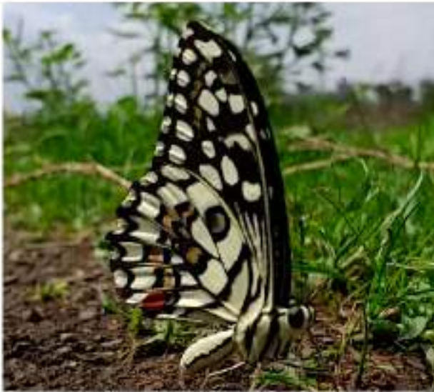
Northern Swallowtail Vinod Shekhar Kulal, SYBSc A